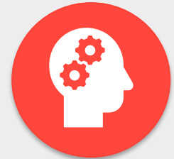
Caitlin Grainger-Spivey Undergraduate